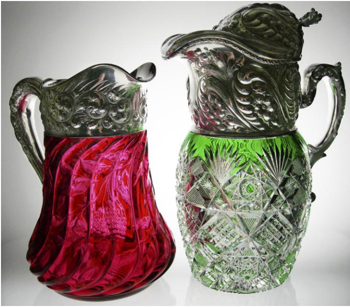
Green-cut-to-clear Ewer with massive Gorham sterling top, 12" h; Cased red jug with Gorham sterling top, attributed to Hoare, 9 1/2" h.