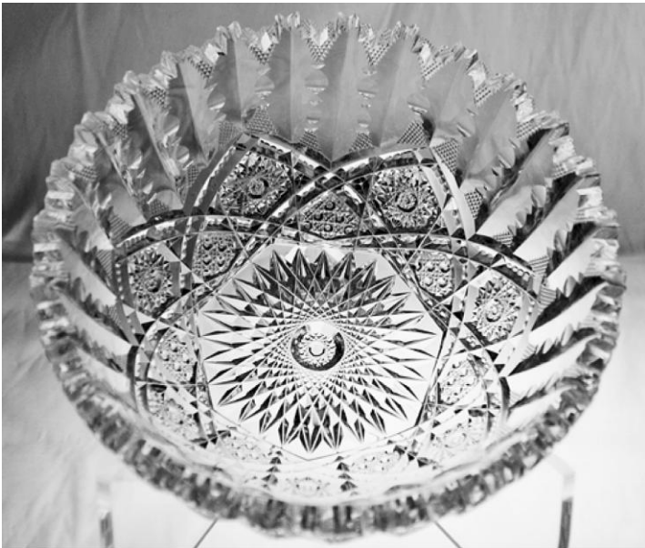
Top view of a bowl whose cutting design combines features of Dorflinger Chester and No. 99 patterns.